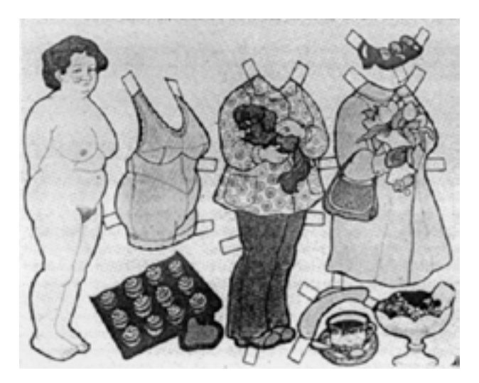
Realistic dolls. Swedish paper doll exemplifies the frankness about the human body that is needed to inculcate wholesome attitudes toward sex and violence. In this paper doll, no attempt is made to idealize or de-sexualize the human body; the body is simply accepted as it is.

The beneficial stimulation of whirlpool baths should not be limited to hospitals or health club spas, but brought into the home. The family bath should be large enough to accommodate parents and children, and be equipped with a whirlpool to maximize relaxation and pleasure. Nudity, openness, and affection within the family can teach children and adults that the body is not shameful and inferior, but rather is a source of beauty and sensuality through which we emotionally relate to one another. Physical affec-