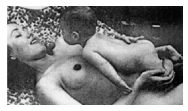
The first months. Breast-feeding and caressing will help this infant to grow into a non-violent adult. Denial of such body contact in infancy can have the opposite effect.

When the six societies characterized by both high infant affection and high violence are compared in terms of their premarital sexual behavior, it is surprising to find that five of them exhibit premarital sexual repression, where virginity is a high value of these cultures. It appears that the beneficial effects of infant physical affection can be negated by the repression of physical pleasure (premarital sex) later in life.